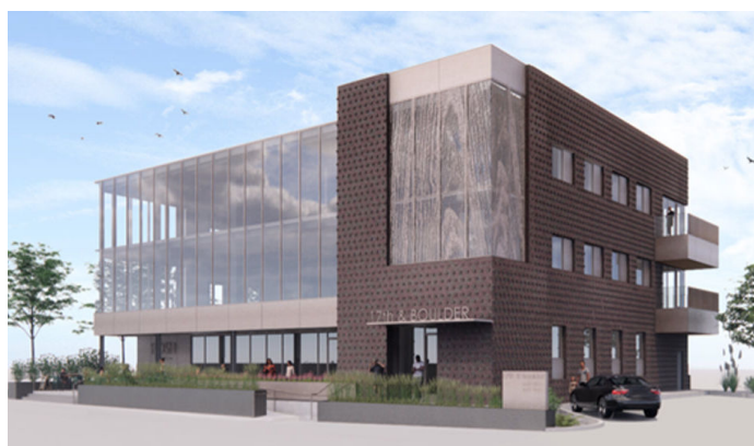
17th and Boulder - Very Original Name for new office building

Perhaps it was to describe how both the 2017 and 2024 eclipses were visible from St. Louis. That would explain the lack of a date. There were an awful lot of oddities about the little 2x3 plate in the ground, but I knew I had to find out what the story was, and make sure other astronomy enthusiasts did too. When people came to Tulsa, we could show them the strange little marker, a sort of oddity to match any along Route 66. After all, St. Louis is on the Mother Road too.